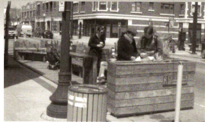
"People Spot" public gathering spaces